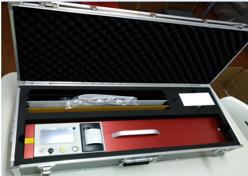
Solid Alum. Case packing